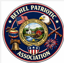
Bethel Patriotic Association