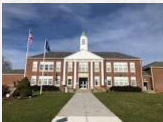
Clifford J. Hurgin Municipal Center