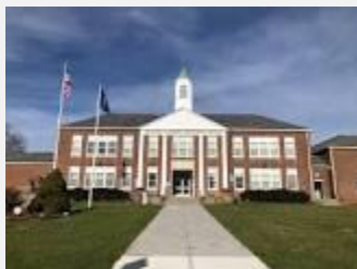
Clifford J. Hurgin Municipal Center