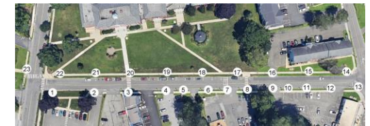
Map showing the approximate banner locations on School Street.

The application can be downloaded from our website www.bethelhometownheroes.org or by stopping in at the First Selectman's Office at the Bethel Town Hall. Applications require the filled out form, a photograph copy of the hero preferably in military uniform, proof of honorable discharge, photo release acknowledgement and a check for $140 or $200, which will cover the printing and installation costs. Even if you were not honoring a veteran, donations to support this effort would be welcomed to help offset costs.