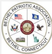
Bethel Patriotic Association